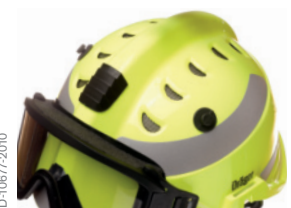
XL special rotating wheel